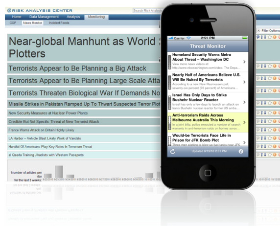
The RAC uses type size and color to indicate importance of threat items. Large type items indicate high relevance.

Using client-determined key words and Digital Sandbox's proprietary analytics, the TM scores and prioritizes incoming information items, constantly updating and reprioritizing, depending on the incoming news feeds and events/activities they are reporting.