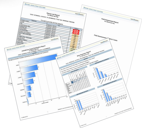
On-demand performance management and analysis reports.

A wide selection of reports on assets, threats, risk, capabilities, and assessments – filtered by sector, jurisdictions, capabilities, audience – can be generated as needed.