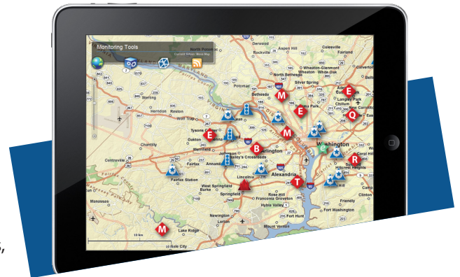
The RAC's Special Events Common Operating Picture displaying locations of real-time Calls for Service, AVLs, and critical assets, on an iPad.™